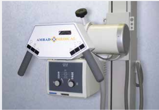
Economical Alternative FMT