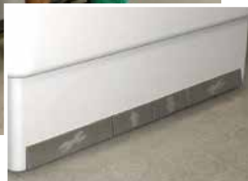
Convenient Lock-Release Pedals