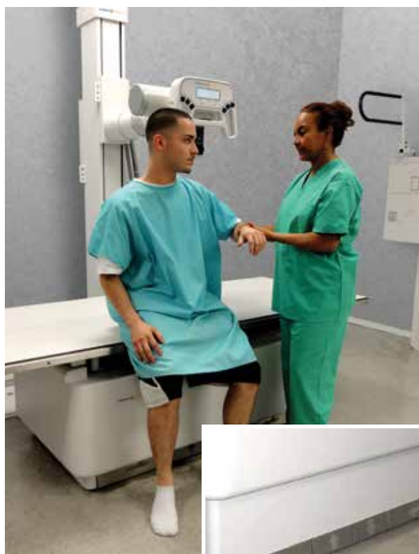
Easy Patient Transfer