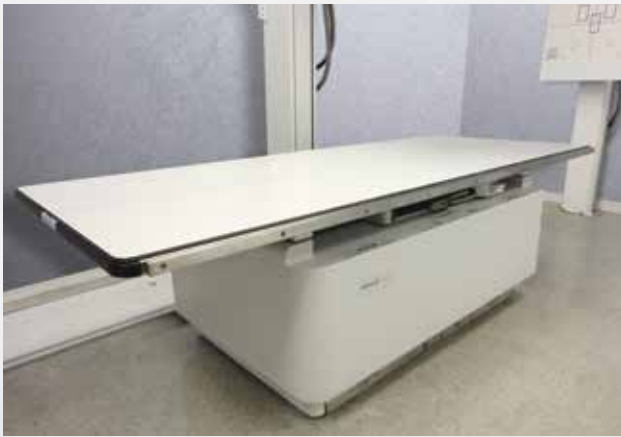
35.5" Wide Table Top