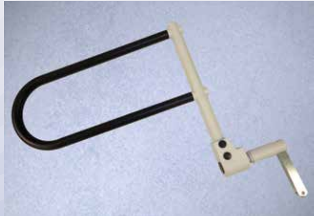
Overhead Grip for J1000 Wallstand