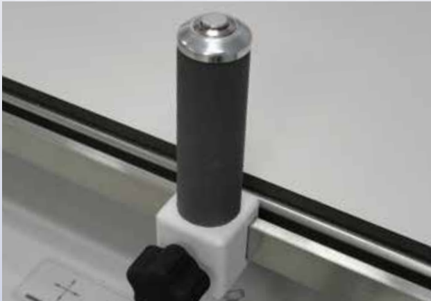
Table Lock Release Handle